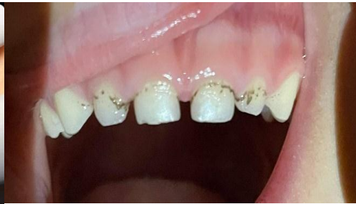
5years old picture shows attrition in upper teeth Class I Bruxism. In enamel no exposure of dentine Class I Bruxism