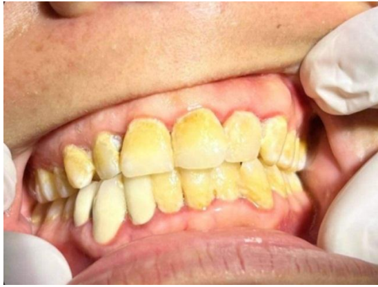
Male Patient picture 30 years old shows attrition in upper incisors teeth wear of enamel layer class II Bruxism

their teeth together when they expose to stress or anger (Class II). Returning to their medical history, patients have one of their grandparents at least suffering from same problem.