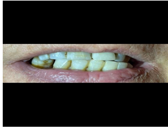
Male patient picture 50 years old shows occlusal central attrition of upper and lower central incisors, class II Bruxism

Female patients aged ( 35,60 years) contacted Al Gamal Dental Center with sever dental pain and fair worn down in occlusal surface and expose of dentine ( Class III). Following their medical history, their grandmothers have same chief complain and wear night guards. In the case history sheets, patients mentioned that they clench and grind their teeth as a way to getting rid of stress.