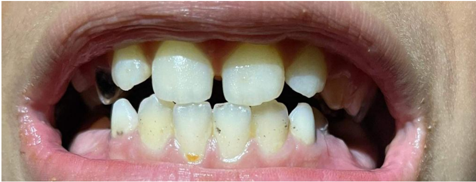
Child patient 8 years old picture shows attrition in upper central incisors in enamel layer with mild sensitivity in teeth, Class II Bruxism.

Some of the patients of this study refused to published their pictures.