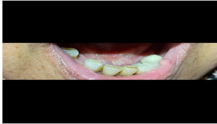
Female patient 60 years old picture shows sever attrition in lower teeth with exposure of Dentine. Class III Bruxism.

Child patients aged ( 5,6,8,9,11years) came with their parents to Al Gamal Dental Center with chief complains of mild teeth sensitivity and occlusal teeth attrition. As history taking from their parents, at least one of the family members were suffering from same chief complain. Following their case history sheets , child have grinding teeth habits when they expose to fear, anger, or stress.