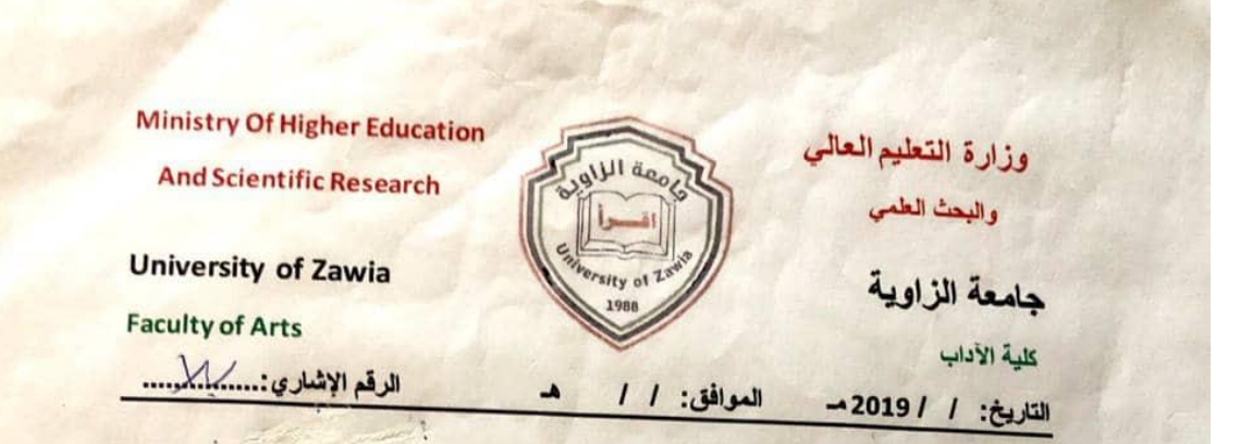
Appendix 7 Written permissions to conduct the study in the selected schools