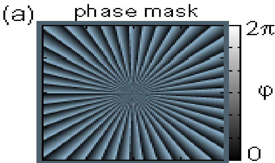
Fig. 3-Conventional diagram of holographic twists in the optical vortex

These findings of the paper significantly impact on the general principles of optical vortex. The authors described more rational and significant mathematical modal which can explain the structure and different properties related to this type of dislocation of the optical waves. This study provides a conceptual framework on which, further research work is conducted in the field.