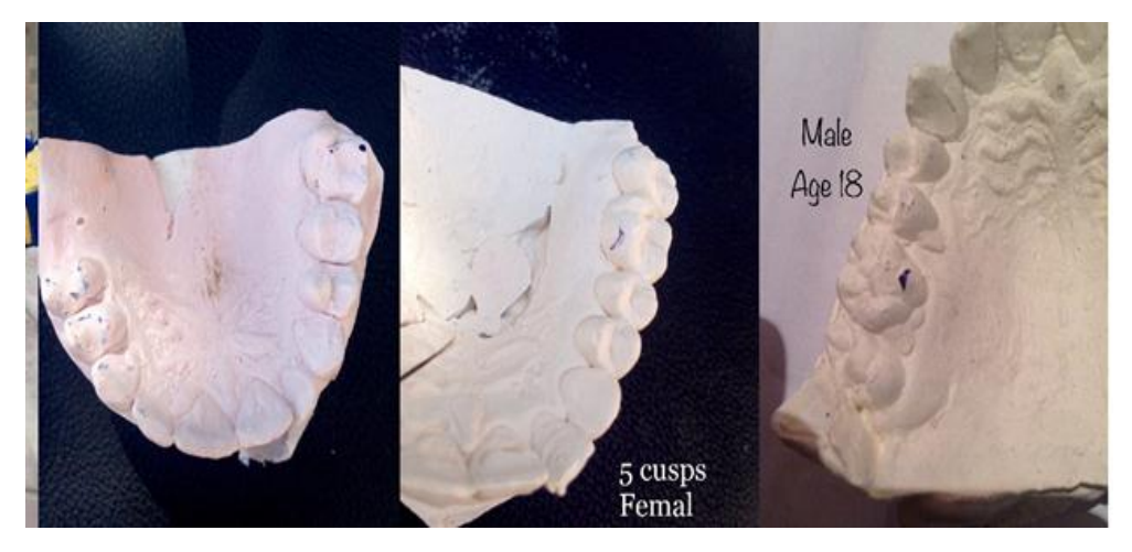
Figure 1 `: The final model cast

Out of 500 selected individuals, 258 were males and 242 were females, and (figure 2) shows the gender and the number of cusps in permanent maxillary first molars. 320 (64%) cases of the permanent maxillary first molars had five cusps while 179 (35.6%) had four cusps and 1 (0.4%) cases had three cusps. The unique finding of the three cusped permanent maxillary first molar in one individual was that they were present bilaterally in all the one case. In this case, it was present on both the right and left side. Statistical comparisons between the number of cusps and gender were highly significant (P value = 0.001) and is shown in Table 1.