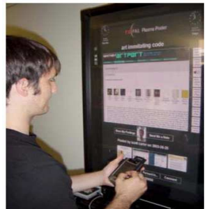
Figure 3 illustrates Annotating a public posting using a Personal Device [16].

In addition, E. Churchill, et al (2004), they argued that the Digital Graffiti system enables traveller users to annotate content displayed on a public screen, which relies on sending data from a mobile device over a network connection to a public display. Users of this system can use a PDA (Personal Digital Assist) to create notes relating to content shown on the public display. Then shown alongside the content on the public screen [16]. Figure 3 shows how this technique work.